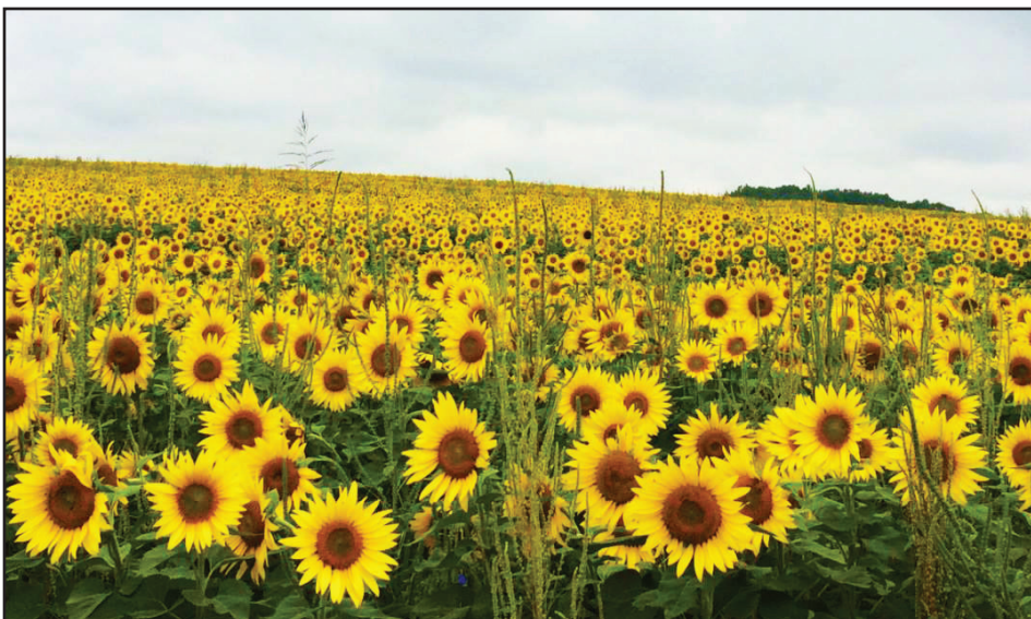
Sunflowers in bloom at the protected Hoffner Farm in Rowan County