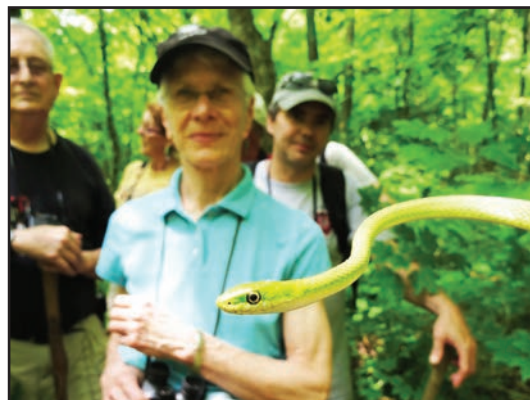
More than 50 people attended our Naturalist Weekend

This year's naturalist weekend brought out more than 50 people for hikes and kayaking at our unique 1300-acre Low Water Bridge preserve. A plethora of flora and fauna were spotted during the weekend, including scarlet tanagers, prothonotary warblers, woodcock, dwarf larkspur, rough green snake, pickeral frog, atamasco lilies, crayfish, eastern box turtles and many more. Our Saturday afternoon kayaking ended up as an adventure when a passing thunderstorm brought a bit of marble-sized hail our way, but we made it safely to our take-out and had a great story to tell. Many thanks to John Gerwin, curator of ornithology at the NC Museum of Natural Sciences in Raleigh for leading the event.