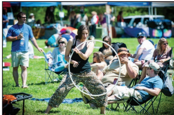
Attendees enjoying beautiful weather and good music at the third annual Earth Day Jam event in May.