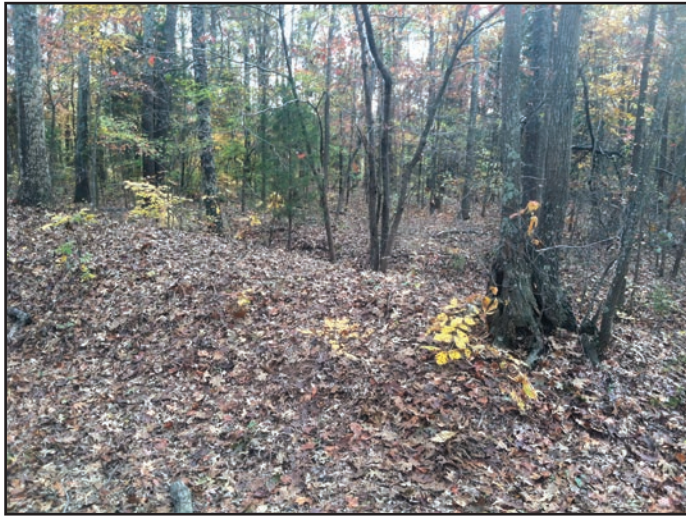
One of the earthenware trenches found on the Fort York site. (Continued from page 1...)

It is also a very high conservation priority because of its location adjacent to the River and Interstate 85. With recent widening of the interstate and a new bridge, the NC Department of Transportation is donating a historic arch spandrel bridge (the “Wil-Cox bridge”) and some unneeded right-of-way to establish a pedestrian and cycling crossing of the river, as well as a small educational park.