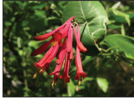
Native coral honeysuckle in bloom on the Wilson Property. This site has a rich botanical biodiversity, providing important pollinator habitat.

Though the land was donated, to ensure that the site was truly preserved in perpetuity, Davidson Lands Conservancy (DLC) reached out to The Land Trust for Central NC (LTCNC) to assist them with the creation of a conservation easement for the site. With the easement in place, DLC can explore transferring the property to another public or private entity that could establish a passive park or community garden or another conservation use helpful to the community. With the location in Cabarrus County and the conservation values found here, the LTCNC board thought this would