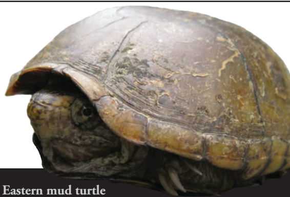
Eastern mud turtle

A publication of The LandTrust for Central NC