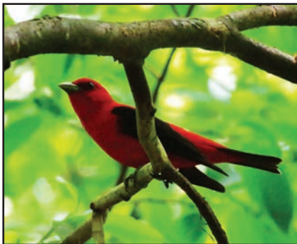
Scarlet tanager spotted during our Uwharrie Naturalist Weekend in May

The LandTrust is a private, nonprofit organization working with private and public landowners to protect the special natural areas, family farms and rural landscapes of Anson, Cabarrus, Davidson, Davie, Iredell, Montgomery, Randolph, Richmond, Rowan and Stanly Counties. With 501(c)(3) status, all donations to The LandTrust qualify for maximum tax deductions.