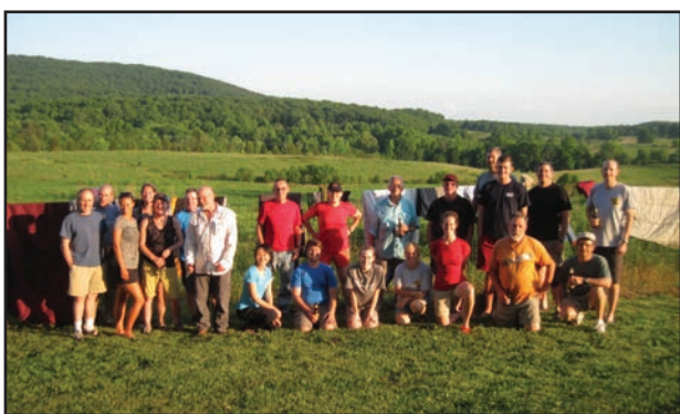
Views from the Uwharrie Trail Thru-Hike camp and cookout location for the last night.

More than 50 people joined us on our second annual Uwharrie Trail Thru-Hike! This year the thru-hike took place the last weekend in May, and though the first two nights brought rain showers, it did not dampen the spirits of the thru hikers. Daytime weather was beautiful, and views of the Uwharrie mountains, cool running springs, wood thrush singing in the forest, and good fellowship with friends old and new was reward enough for making the 40 mile trek. Thanks to years of conservation work, the full trail can now be hiked in its entirety. A new section over Little Long Mountain and King Mountain was a highlight for many attendees. We hope you will join us next year - May 28th through 31st 2015! More details and info coming soon!