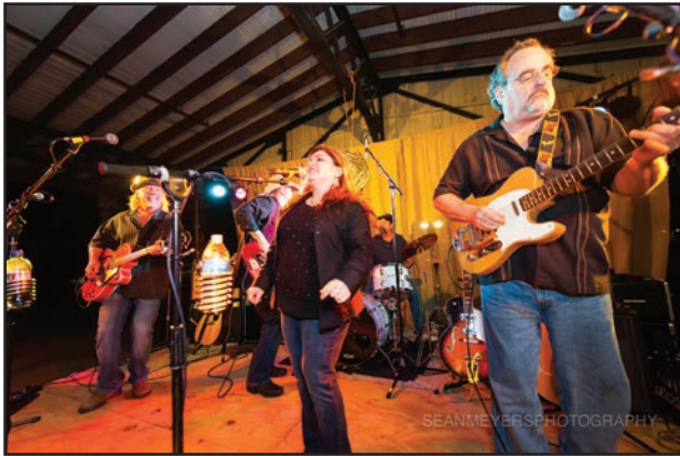
The Flatland Tourists put on a great show at RiverDance 2014! Many thanks to all of our sponsors, committee members, volunteers, and attendees who made this event a success! Thanks for your support of The LandTrust for Central North Carolina!

We would like to express a huge thank to you all the sponsors and supporters who provided financial support for this event, and to everyone who purchased a ticket. Thanks go out also to the committee and volunteers who pulled together another fabulous RiverDance event. It would not be possible without the help and support of all of you!