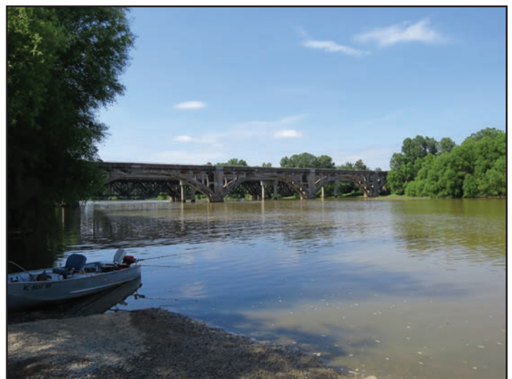
The Wilcox Bridge over the Yadkin River. This river access area will soon incorporate the history of the nearby Fort York Property.