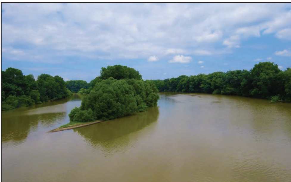
The Yadkin River as seen from Wilcox Bridge, just west of the 13-acre Fort York Property that The LandTrust is working to protect. The Battle at the Yadkin Bridge was the last Confederate victory during the War Between the States in North Carolina.