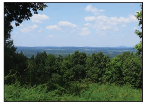
View from McArthur Property future trailhead for the Uwharrie Trail.