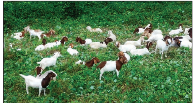
These goats spent a few weeks at Spencer Woods ridding the preserve of invasive kudzu to the entertainment of local residents.

Thanks to a partnership with The Conservation Trust for North Carolina (CTNC), the Youth Conservation Corp spent two weeks this summer diligently working to improve the trails at Spencer Woods. The LandTrust worked with the Town of Spencer to protect this property a few years ago, and though the town now owns the land, The LandTrust continues to assist with management of the park. These young people, varying in ages from 18-24, grubbed, benched, pruned, and raked the trails here to make them more easily visible and walkable for all. Thanks to CTNC and to a grant from the N.C. Parks and Recreation Trust Fund (PARTF) for providing the money that made this work possible. In September, The LandTrust contracted with a local group to rent a herd of goats. Their main mission? Tackle the expanding kudzu invasion that had begun at the edge of the Spencer Woods property. Goats are a great natural way to rid the area of the kudzu, without spraying chemical herbicides or paying for more costly hand removal of the tough vines.