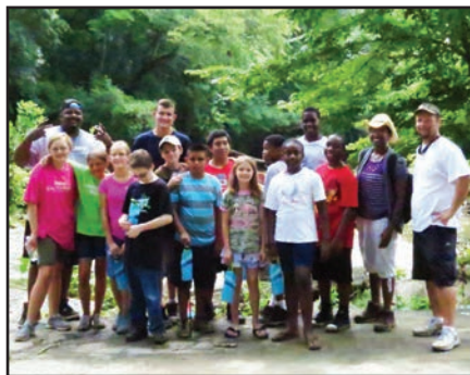
Montgomery County Communities in Schools camp visits our Low Water Bridge Preserve