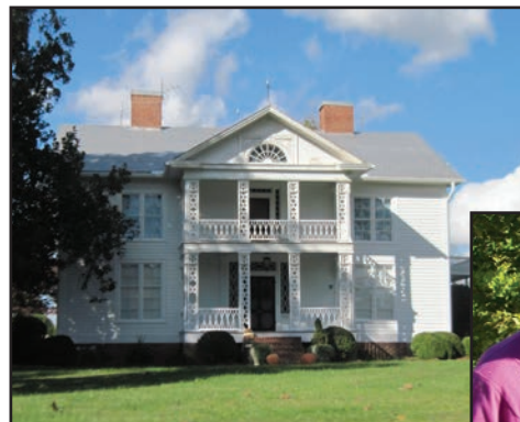
Historic Daltonia Plantation

We have much heritage to be proud of here in this region. Thanks to your support, The LandTrust has been able to ensure that some of our most important natural AND cultural landscapes will exist for future generations to appreciate, and from which, to learn.