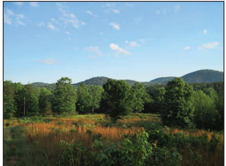
Panoramic views from the Capel Property - soon-to-be open to the public as a NCWRC Uwharrie gamelands thanks to The LandTrust.